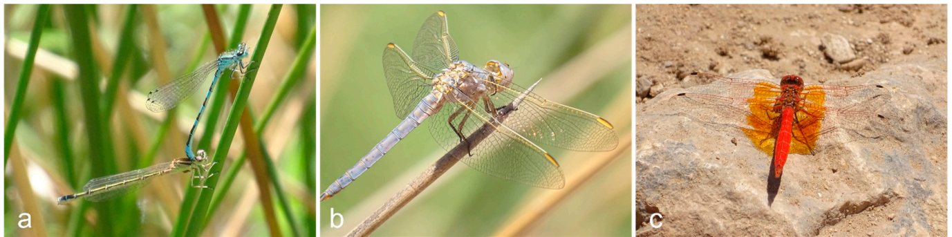
Figure 3. Pictures of some odonate species found in this study. (a) Coenagrion mercuriale ; (b) Orthetrum nitidinerve (Mediterranean endemic); and (c) Trithemis kirbyi .