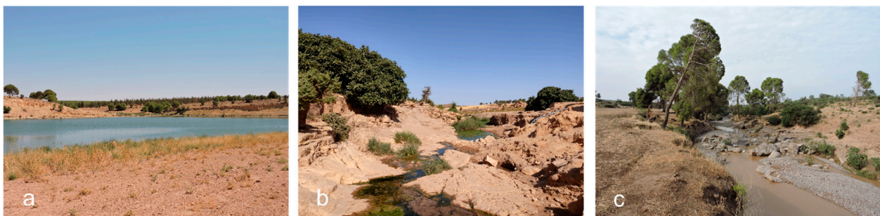
Figure 2. Habitat types surveyed in this study. (a) pond (Site 3); (b) stream (Site 6); and (c) river (Site 18).